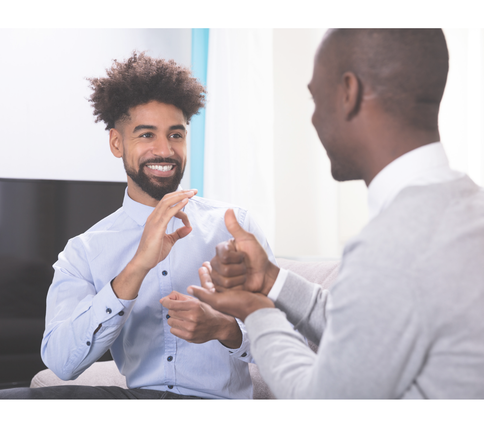
Employees with a Disability