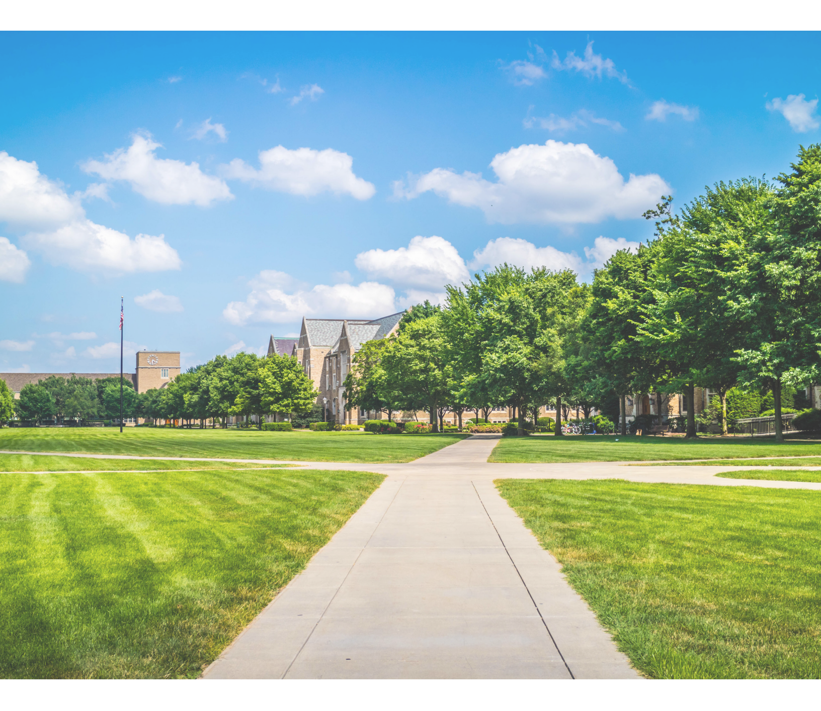
Overall Campus Experience