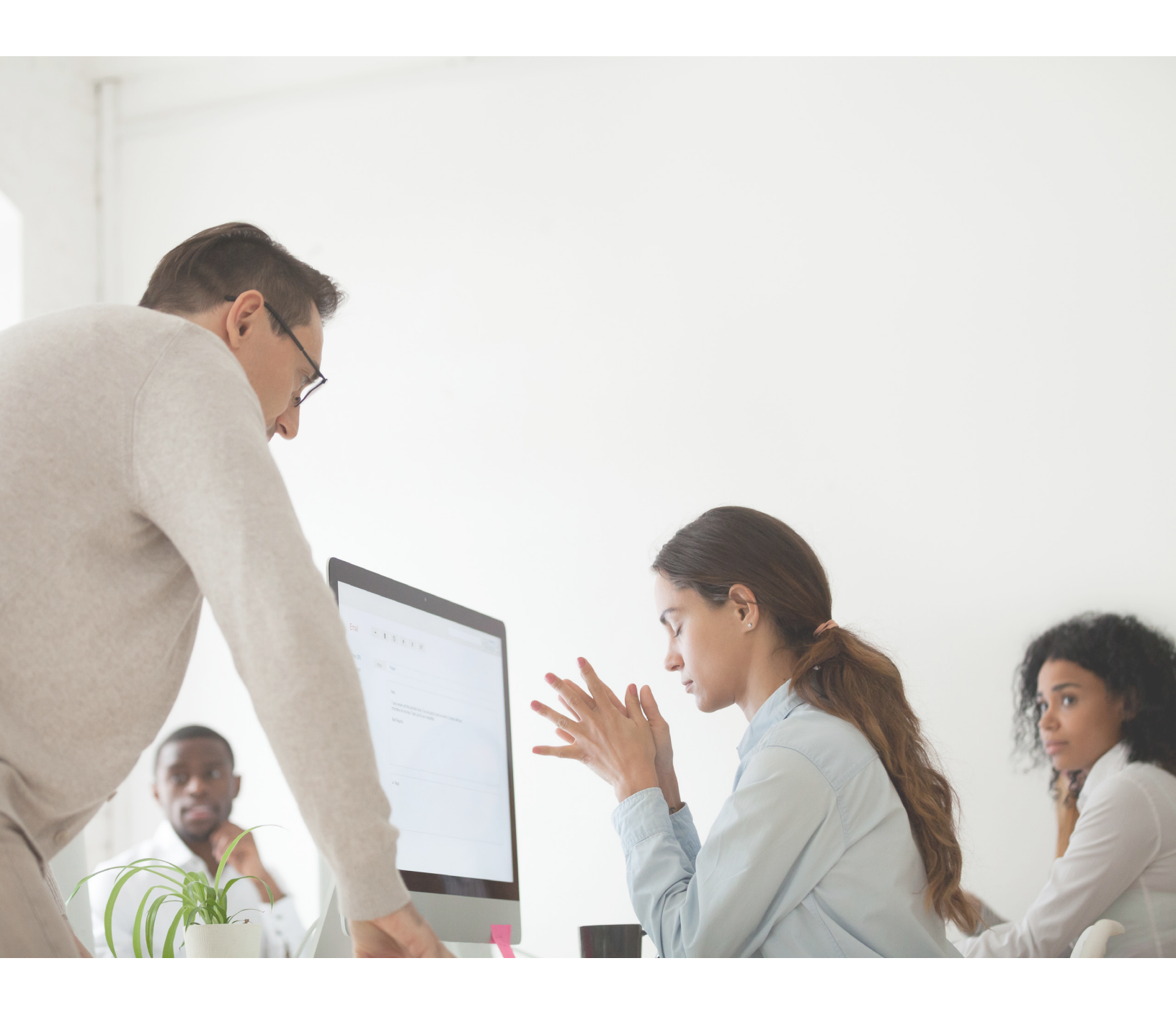
Personal Experiences of Discrimination/Bias/Harassment