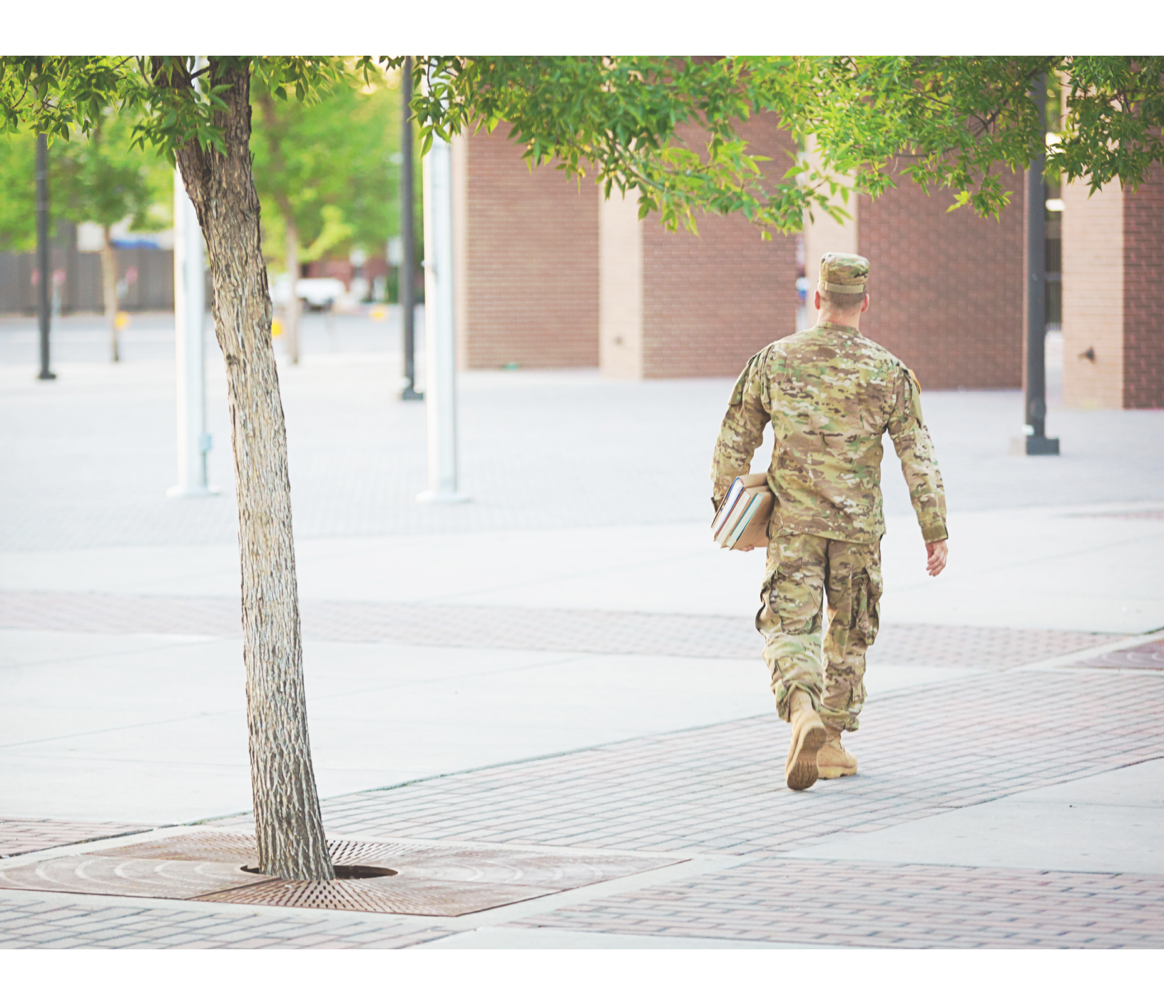
Current United States Military and Veterans